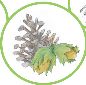
nuts + seeds