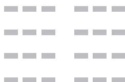
Theatre max 24

N.B. Due to the dimensions of the room horseshoe layout is not possible